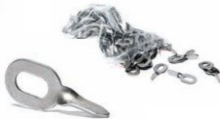
Twisted Bits (5710)