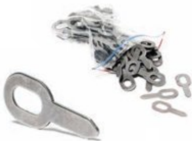
Straight Bits (5700)