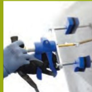
Wide feet space