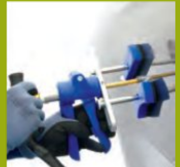
Application with hammer