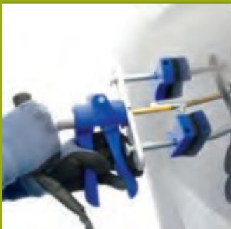
Different base shapes